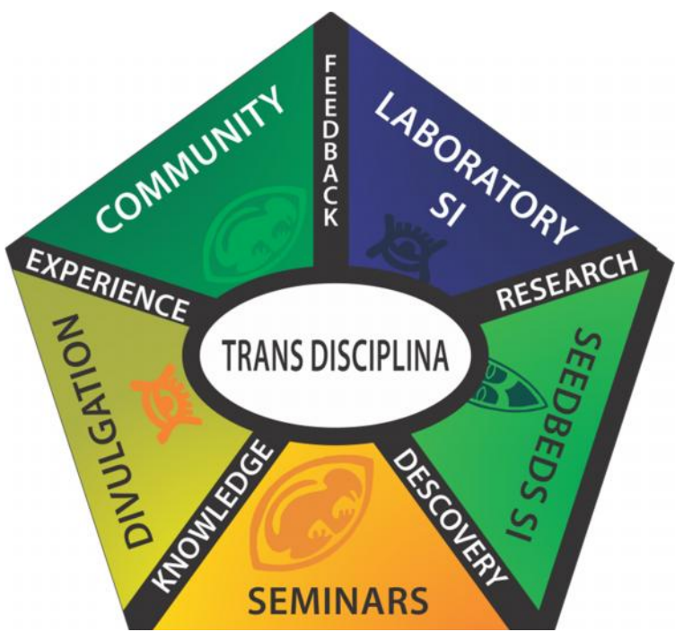
Figure 3. Model of Collegue Education.

Programs guided labs in college student's high school students.