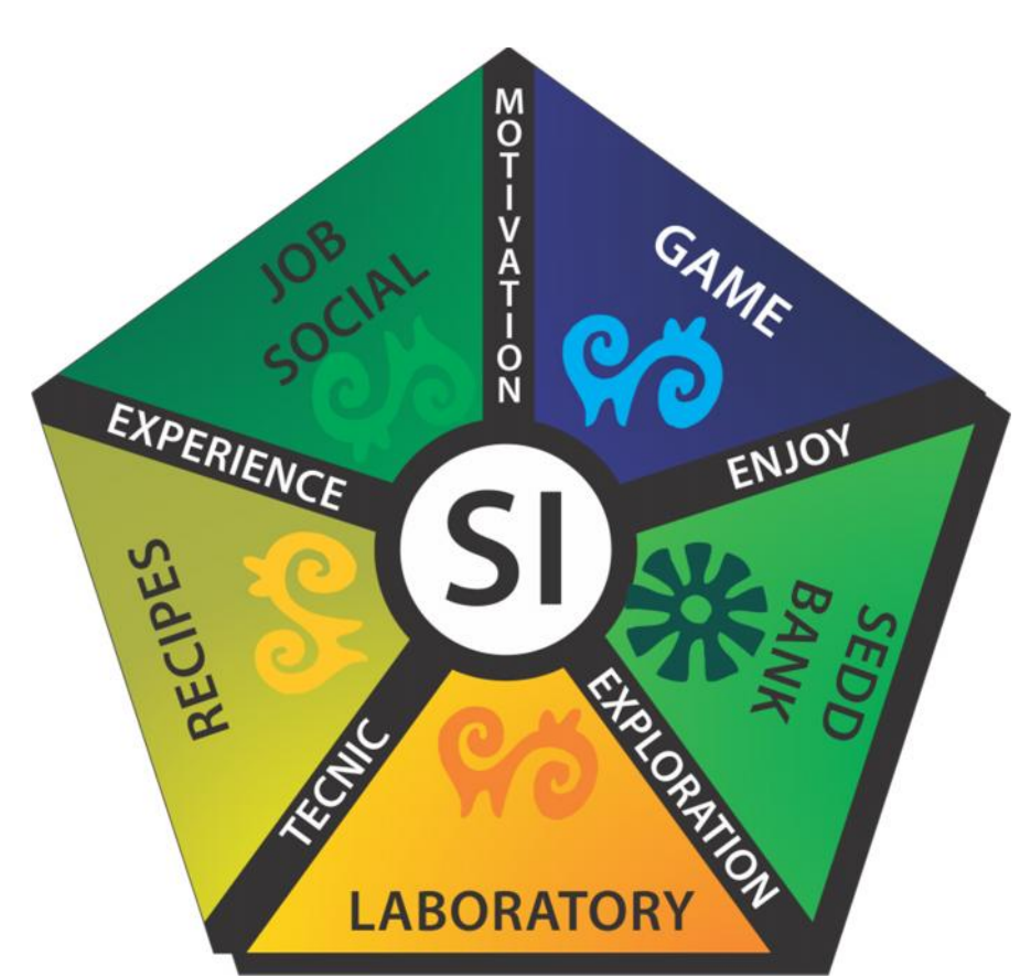
Figure 2. Model of Secondary Education.

Seed bank where they learn to conserve native medicinal plant species, and in the future will allow exchanges with other regions of the country.