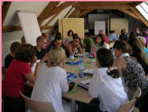
Workshop with researchers and civil society organisations in Austria

To keep track of upcoming events and services that may be of interest to you, please consult the GEMMA webpage regularly and subscribe to receive this newsletter at http://www.gemmaproject.eu